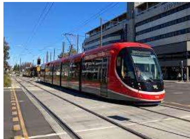
Canberra Light Rail